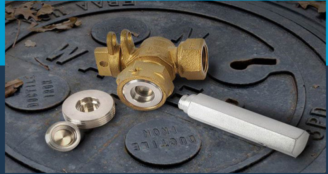
Illustration shown is an angle valve.